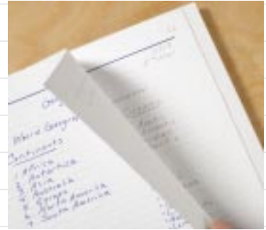
Excellent quality copy, as good as the original and on white paper