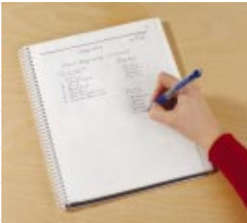
Lays flat for easy writing since it has a plastic spiral binding