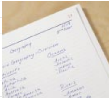
50 duplicate numbered sets of ruled 8 1/2" x 11" paper