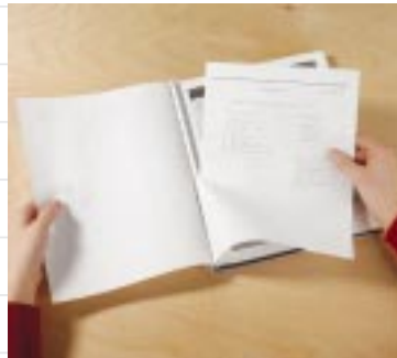
Perforated second sheet tears out easily