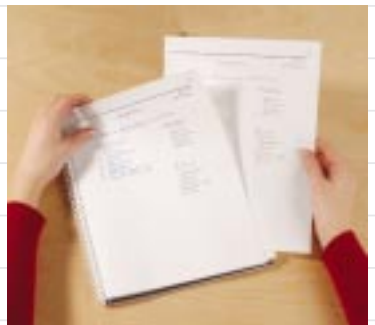
Students get the notes right away - in class