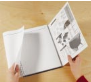
Attached back cover flap folds between numbered sets of carbonless paper